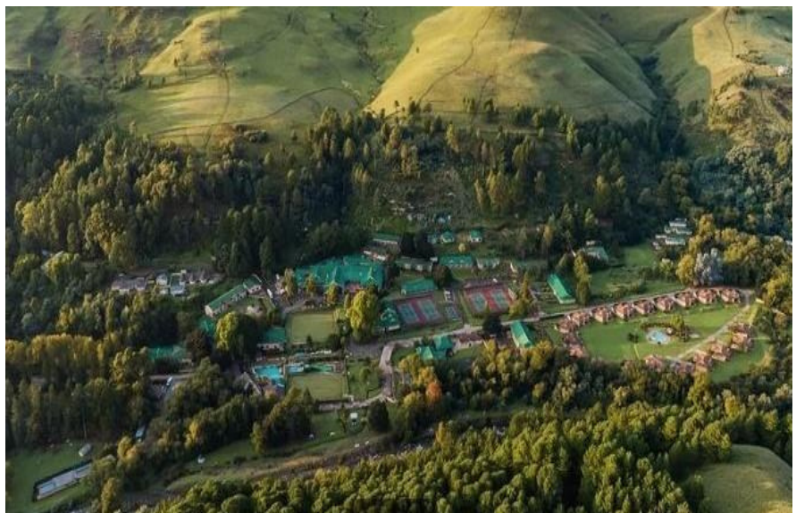
Pictured below: The Drakensberg Gardens aerial view

December 2003 saw a catastrophic fire that destroyed the main hotel building. I well remember phoning Alan late that night with the news that the building was gone.