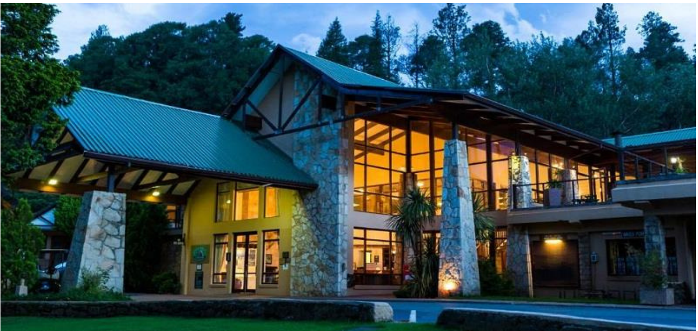
Pictured below: The Drakensberg Gardens Hotel entrance today.